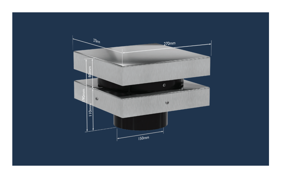
VCM190-1 B2M190-70 Single speed wiring