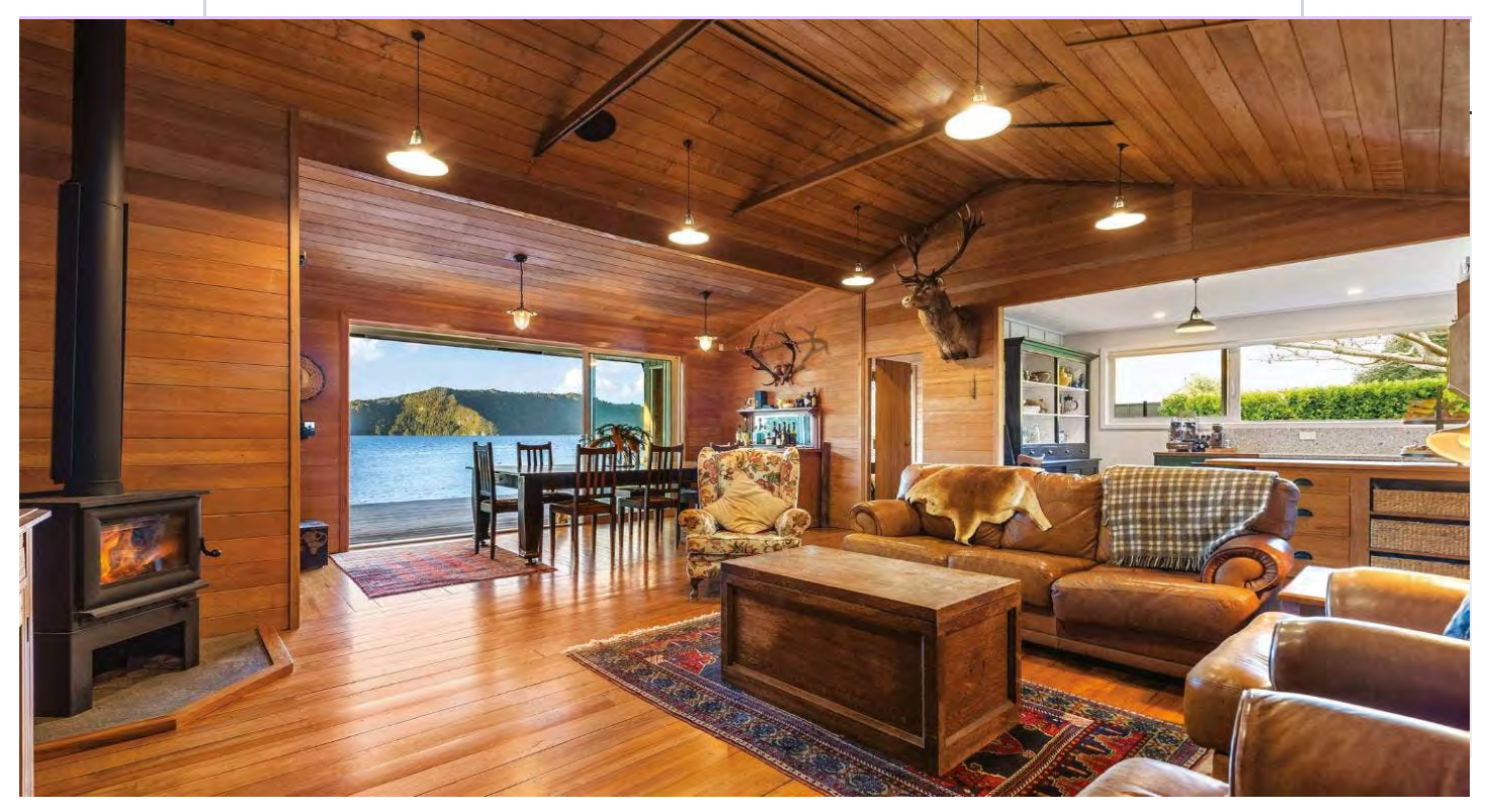
The original rimu wall linings and exposed trusses were retained in the renovation of the historic fishing cottage.

"All the facilities have been updated to a very high standard including modernised insulation, new exterior cladding, and an extension to accommodate a new kitchen and master bedroom."